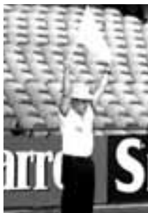
• Behind: from starting position flag brought across, back and down.