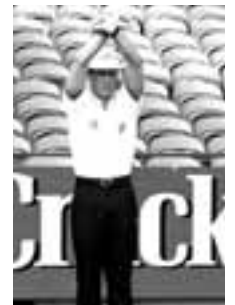
• Blood rule.