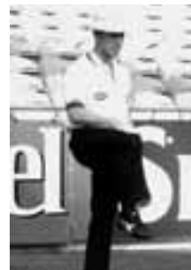
• Ball has come off the leg above the knee.