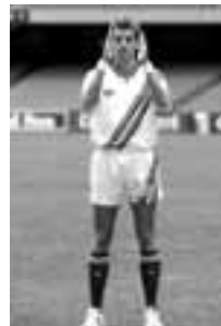
• All clear: goal