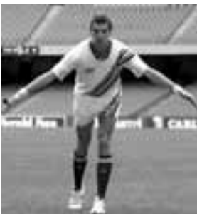
• Illegal disposal by player in possession