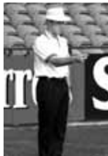
• Behind: untouched.