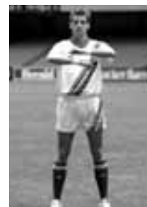
• Player has run further than 15 metres without bouncing