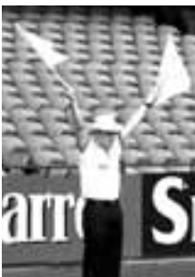
• Goal: from starting position flags will be brought across once, back once and down to sides.