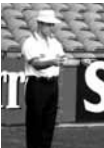
• Goal: untouched.