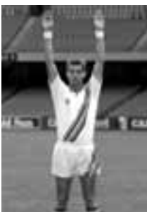
• Ending quarter or game