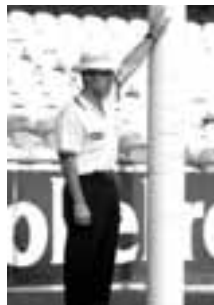
• Ball touched goal post (tap post three times) followed by behind signal.