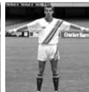
• Illegal shepherding when ball is not within five metres