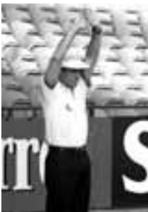
• Ball is touched before crossing goal line followed by behind signal.