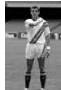
• Player tackled too high