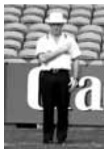
• Behind has been scored – signal to boundary umpire.