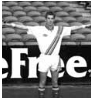
• Out of bounds on full.