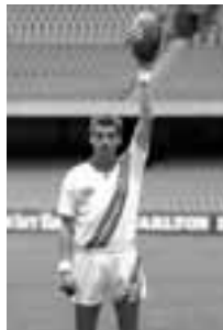
• Starting the game