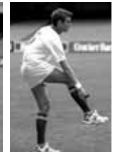
• Player tripped by opposition