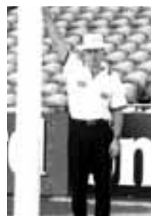
• Ball strikes behind post on full, hit post three times. Then signal out on the full.