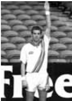
• Out of bounds.