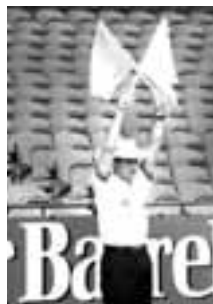
• Score has been annulled.