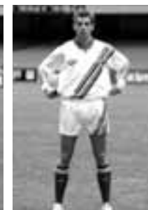
• Holding the man