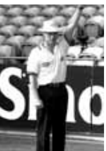
• Out of bounds – signal to boundary umpire.