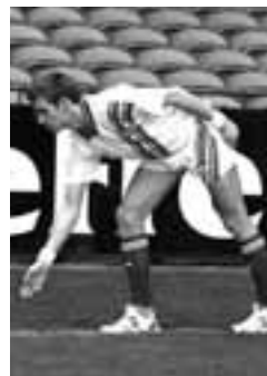
• Indicating where the ball crossed the boundary line on the full.