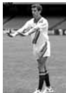
• In the back