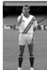
• All clear: behind